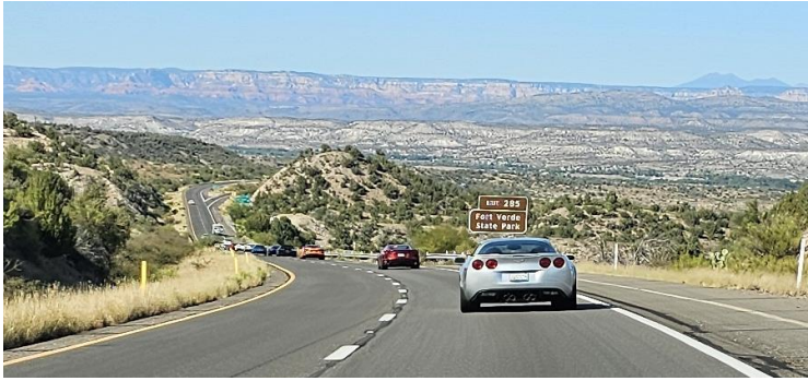
Hey! An actual caravan.

Day 4, Sept. 24: Tombstone to Sedona. We drove 300 miles from Tombstone to Sedona, the land of the roundabouts (aka traffic circles).