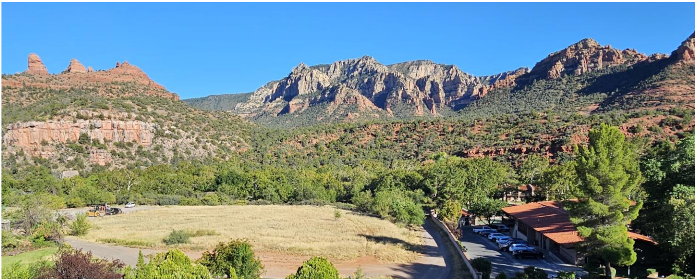
View from the Best Western Plus Arroyo Roble Hotel.

That night, we ate at the Golden Goose American Grill. After a bit, everyone showed up.