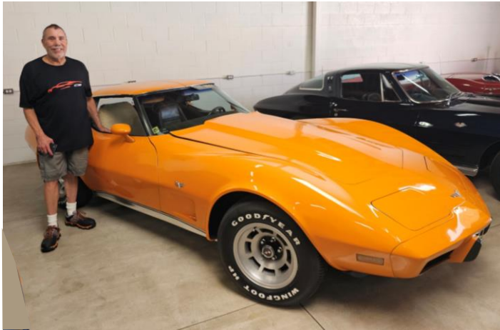
Bob's favorite, based on color alone.