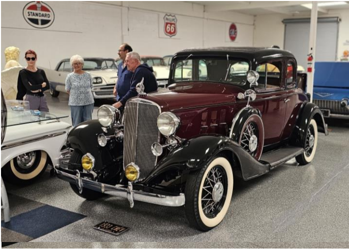
1933 Chevrolet Coupe.