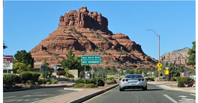
Entering the land of roundabouts.