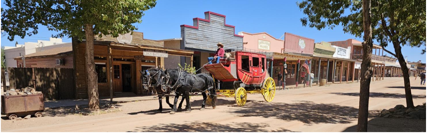
Even with a torch red stage coach, Tombstone's pace seemed a little slow.

Day 3, Sept. 23: Chandler to Tombstone. We drove 200 miles from Chandler to Tombstone, just in time to have lunch at Big Nose Kate's Saloon. Again, we were entertained with live music.