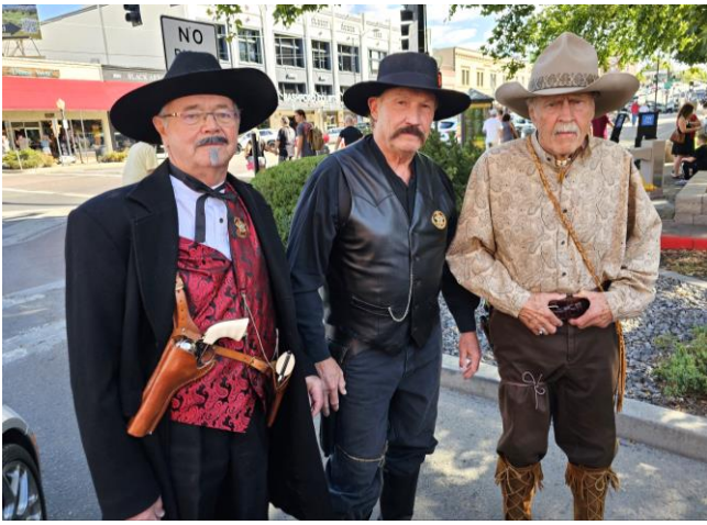
The judges. Their decisions were final.