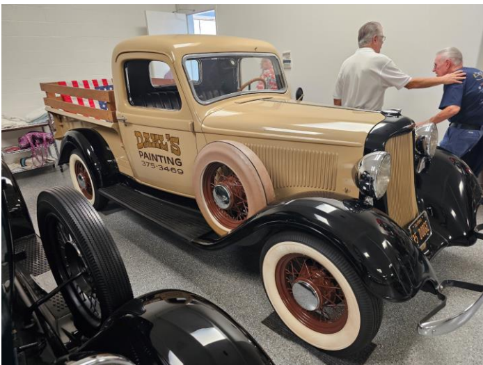
The sponsor, Dahl's Painting.