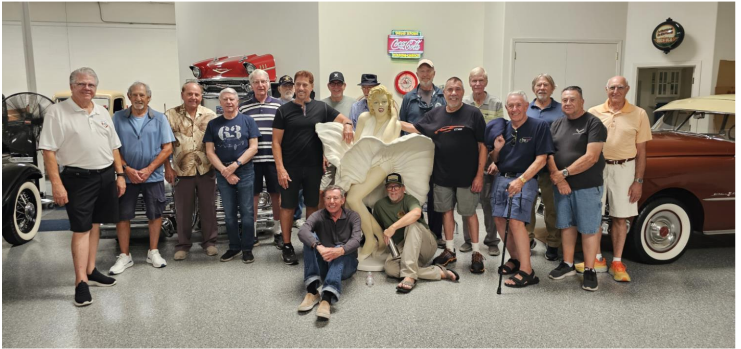
The guys with Marilyn's "Seven Year Itch" pose.

The common denominator for TVS club members is the love of cars, especially Corvettes. We discovered the club members also have an affinity for movie icons Elvis and Marilyn. During the tour, many pictures were taken with the entertainment stars.