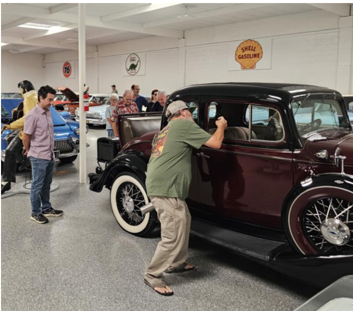
Was our club "MacGyver" trying to retrieve another set of keys?