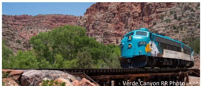
Verde Canyon RR Photo