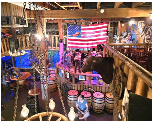
Yes folks, live music with dinner.