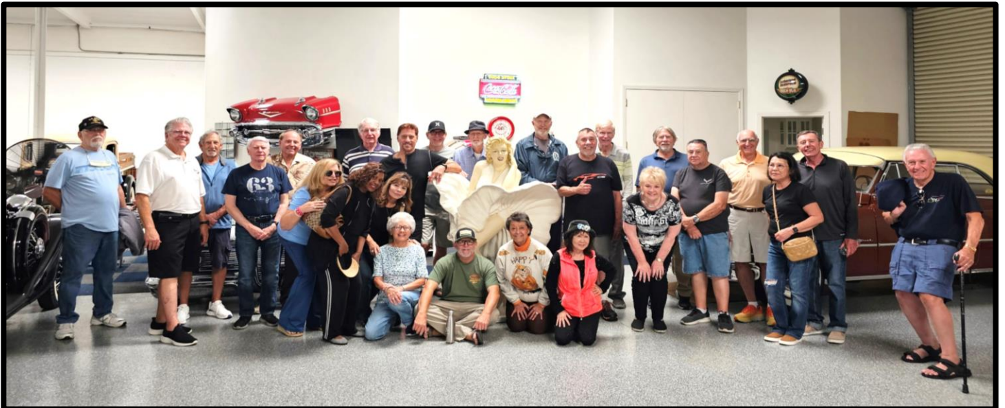
Tour of the Dahl Car Collection