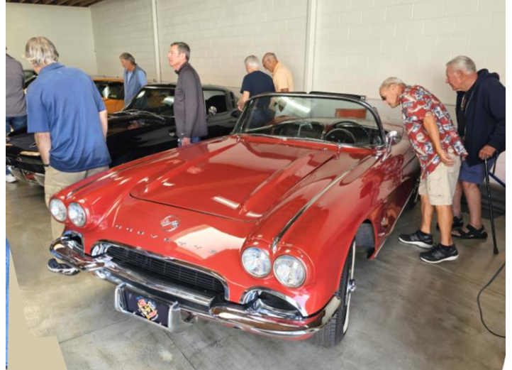
Corvettes were favorites.