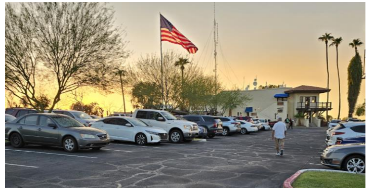
Rustler’s Rooste Steak House for dinner.