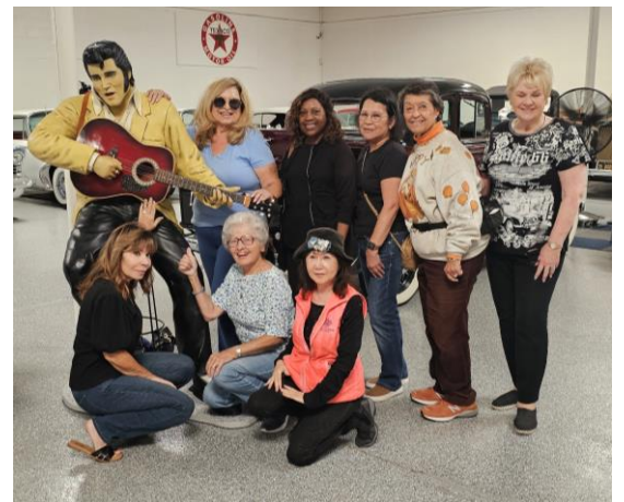
The gals "All Shook Up" with Elvis.