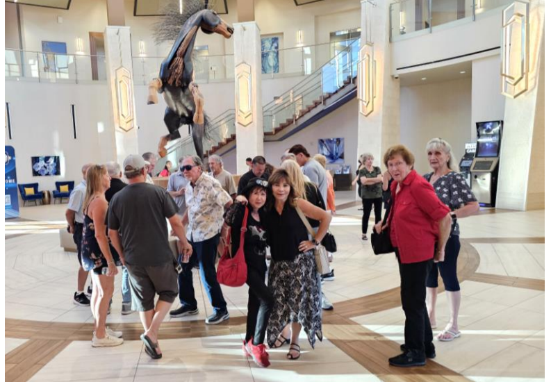
Check in at the Gila River Resort and Casino in Chandler.