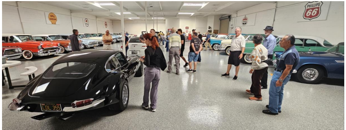
After leaving the workshop, we entered the grand showroom.