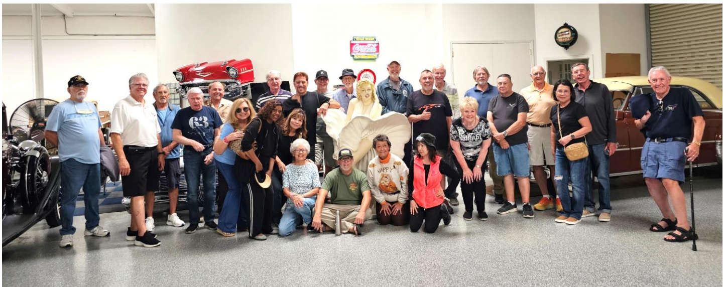
Guys and Gals with Marilyn