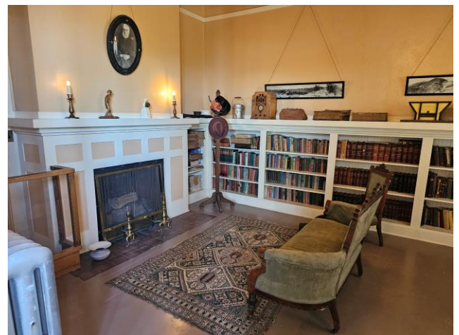
The Douglas Mansion, now a museum, told the history of Jerome.