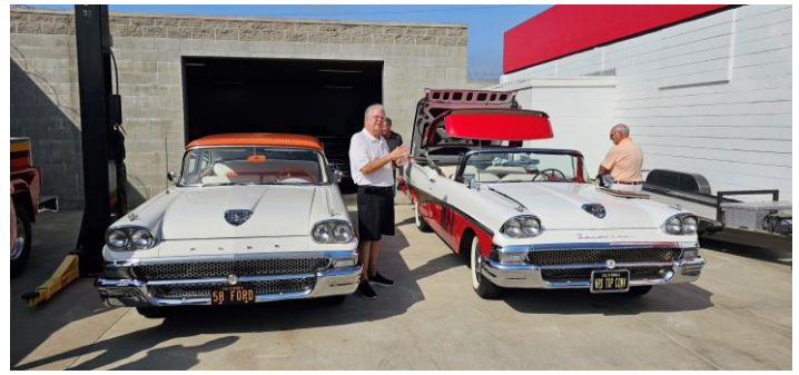
The next step was the Peterbilt truck with the two '58 Fords. (Yes, the truck is part of the collection.)