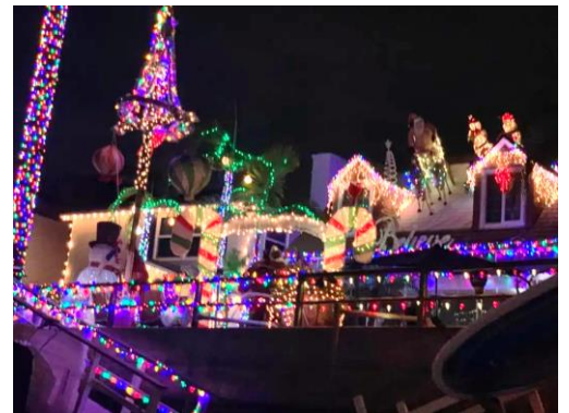
Sights along the canals.