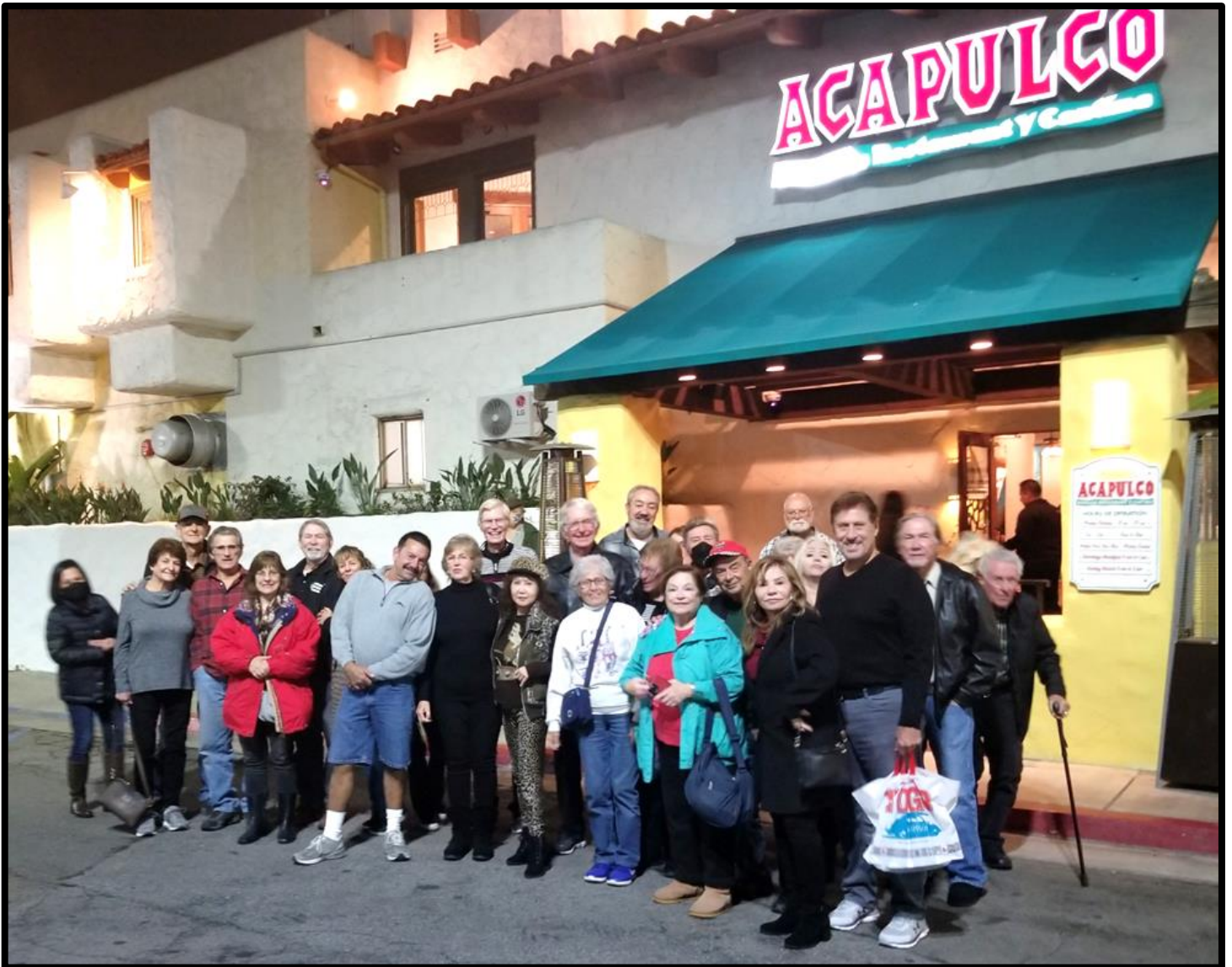
After Dinner Photo before the Gondola Ride in Naples.