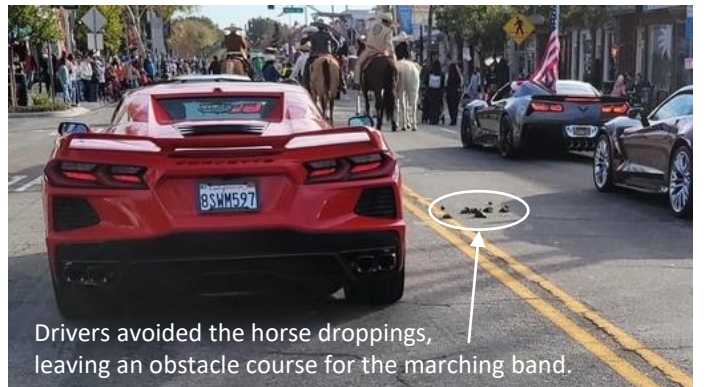
64 th position in the parade: Before the band and after the horses.