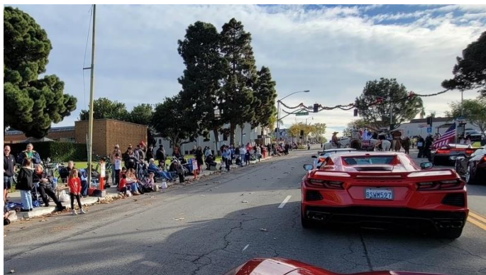
Many young onlookers were hoping for a donut demonstration.