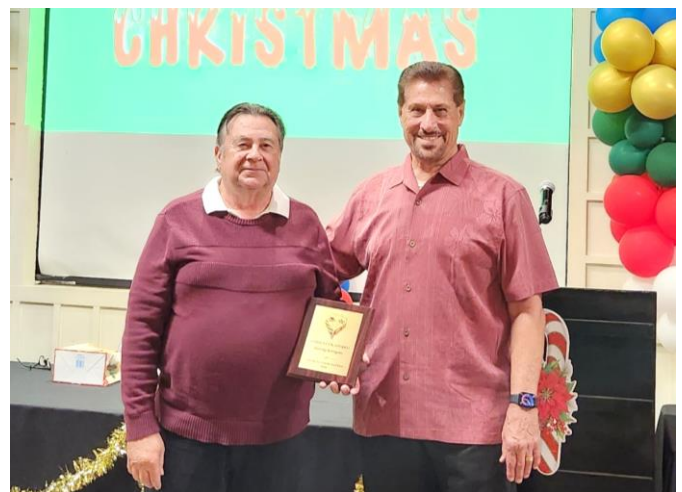
Harry Kenyon Hard Luck Award