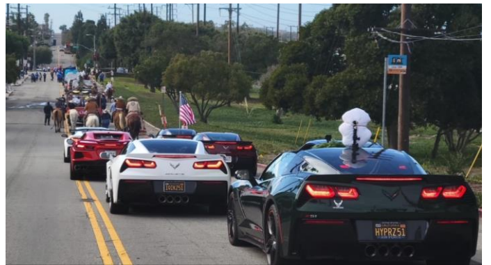
Staging before parade.