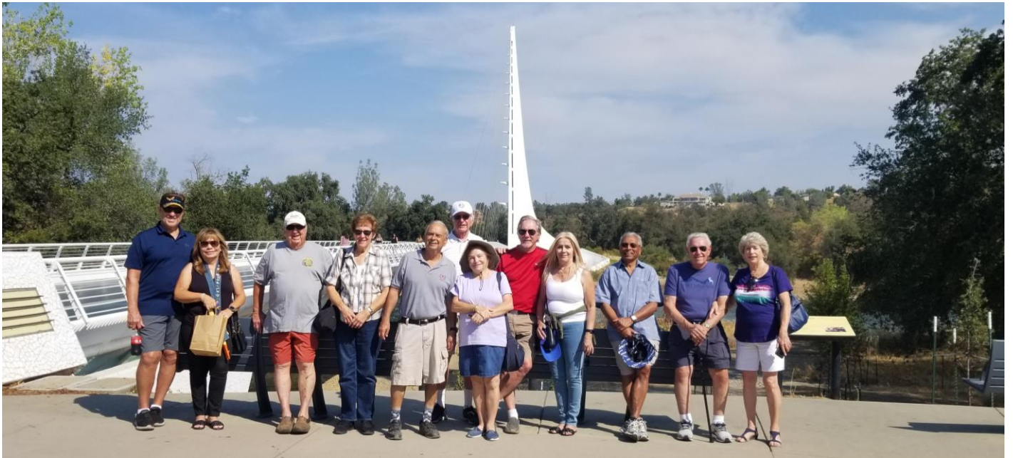
Group photo at Sundial Bridge.