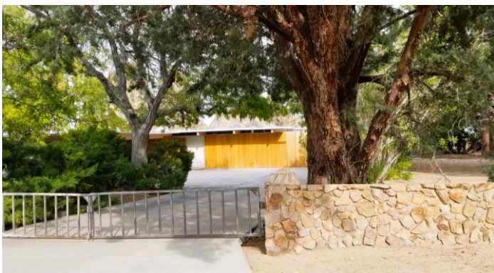
The street view of the Oyler House.