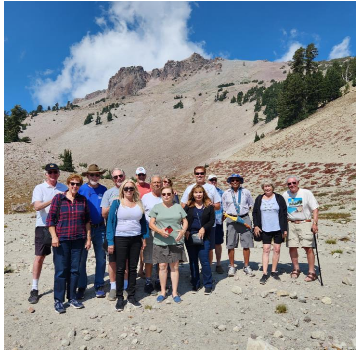
Group photo near Lassen Peak (10,500' elevation).