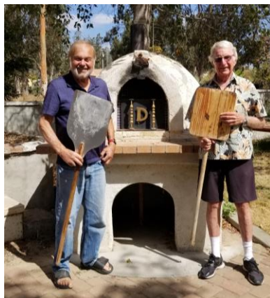
Dom's pizza oven.

We each did a fit-check in the other's car. The Ferrari is lower than the C8 (44.5" vs. 48.6"), but easier to get in and out. Go figure. The engine of this 1989 "Ferrari is a 'flat-12' which is actually a 180-degree V-12" and is similar to the 8 cylinder, double overhead camshaft, flat plane crank engine of the 2023 C8 Z06. Corvette got it right, just a 34 years later.