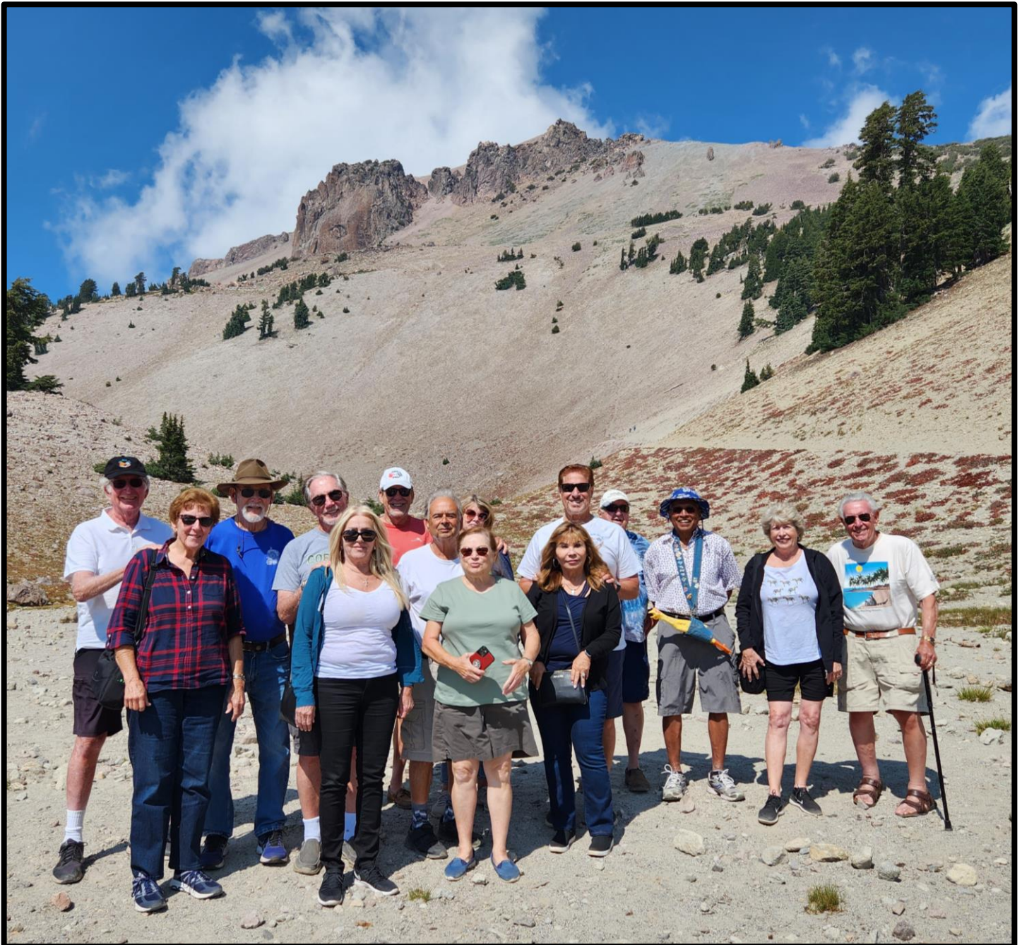
Group Photo near Lassen Peak Reno-Redding Corvette Cruise