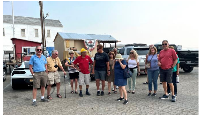
Parked and ready to go.