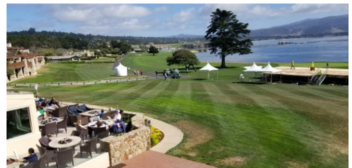
18 th hole, viewed from club house patio.