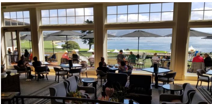
18 th hole viewed from inside the club house.