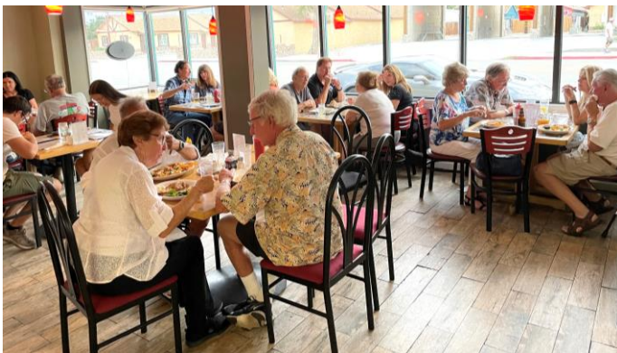
Dinner at The Grill.