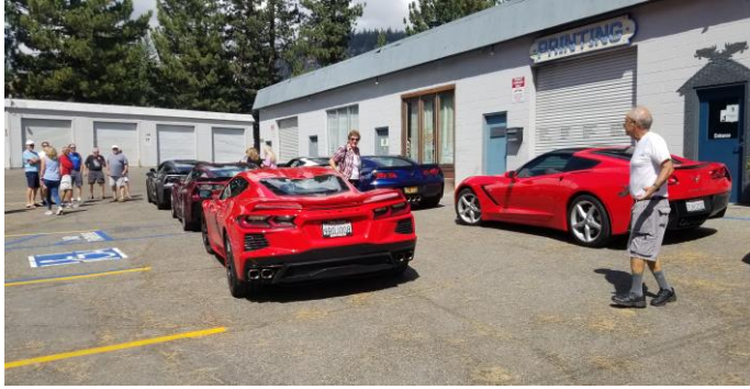
We met in a parking lot to plan lunch.