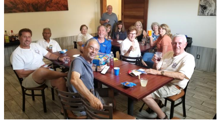
Happy (and noisy) hour at the Best Western.