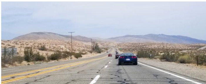
A ride through the desert...