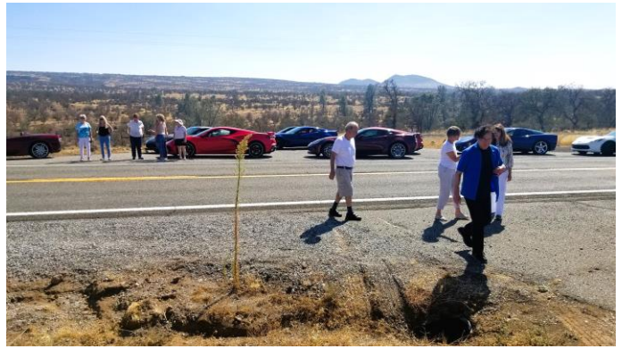
With disaster averted, members of the “C-Team” (C for Corvette) climbed into their cars and motored off to Redding. For them, it was just another day at the “office.”