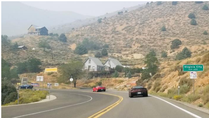
Approaching Virginia City, NV; Elev. 6200'

Day 4. Monday, Sept. 12, Virginia City, NV. We had a fun ride from Reno to Virginia City. Visibility was limited due to the forest fires.