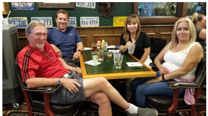
Those that were still hungry, had a late snack in the bar.

Day 3. Sunday, Sept. 11, Reno National Automobile Museum. On this Sunday, we went to Reno's National Automobile Museum. "Most of the vehicles displayed are from the collection of William F. Harrah and opened on November 5, 1989. The museum, which opened on Nov. 5, 1989, has over 200 cars spread over four galleries. Gallery 1 showcases cars built during the 1890s & 1900s, Gallery 2 features cars from the 1910s to 1930s, Gallery 3 the 1930s through to the 1950s, and Gallery 4 displays cars from 1950 onward. [4] Gallery 4 also includes race cars. Each gallery is linked by a themed "street", featuring vehicles as well as faux shop fronts."