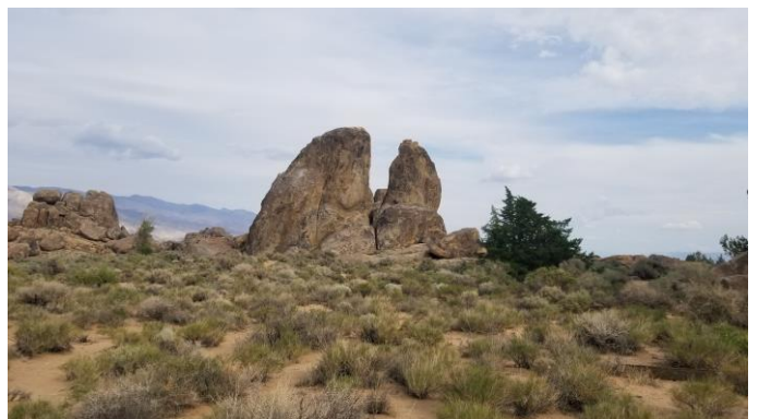
The rock formation viewed by the house.