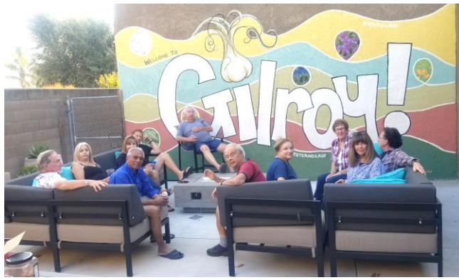
The reward. (happy hour)