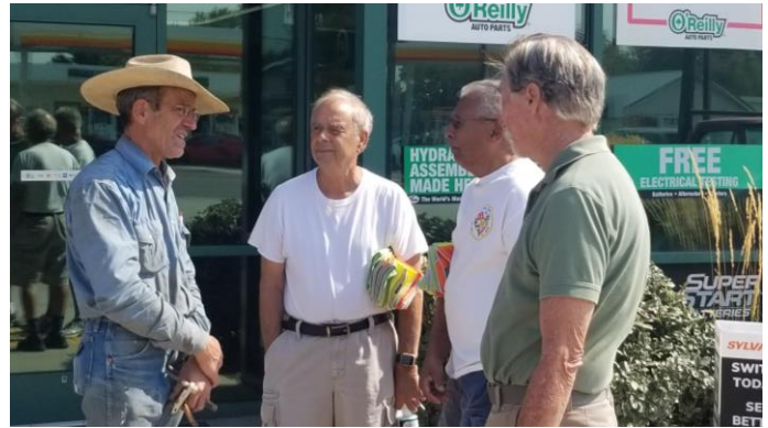
Talking to a sheep herder at a gas stop.