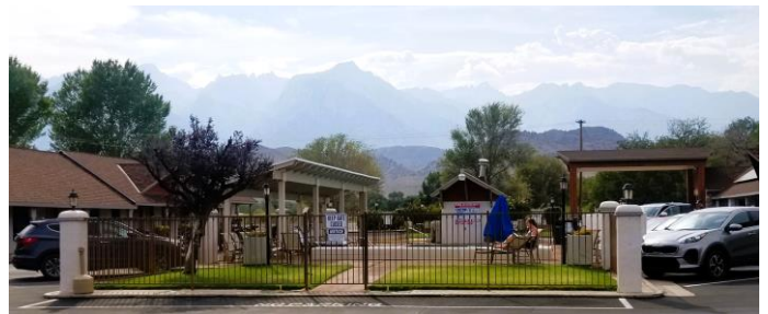
...to reach the BW Hotel oasis in Lone Pine.