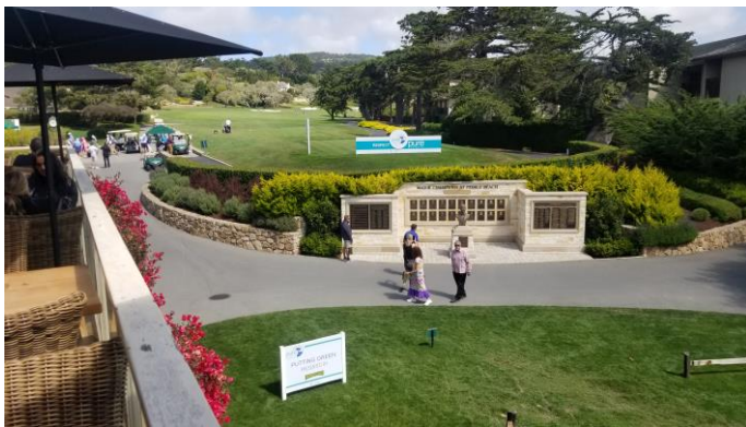
Pebble Beach 1 st hole.

The plan was for all of the cars to go to Monterey after the garlic shops. Due to lack of parking spaces in Monterey, Anton and the Cowleys decided to go on the 17 mile drive. The threesome managed to find Pebble Beach and had lunch on the balcony overlooking the first tee. After lunch, they went to the club house that overlooks the 18 th hole.