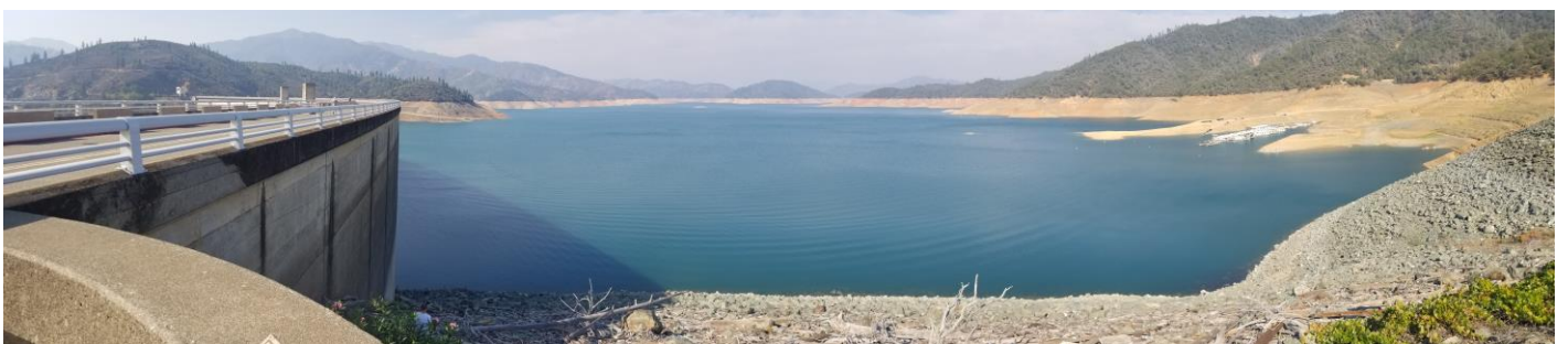
Lake Shasta at 34% maximum capacity.