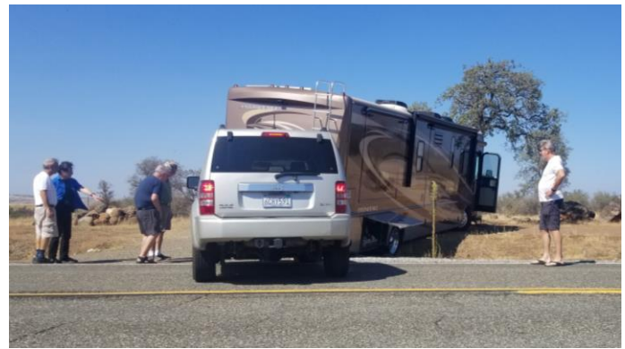
Motorhome in the ditch with towed Jeep in westbound lane.