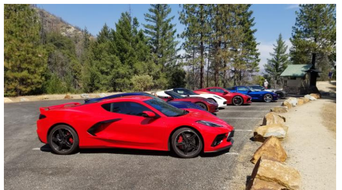
Picnic at Whiskeytown Lake.