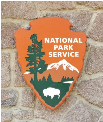
National Park Emblem.