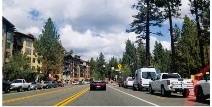
Since my last visit, the size and number of apartments had increased.