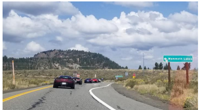
Approaching Mammoth Lakes for lunch.