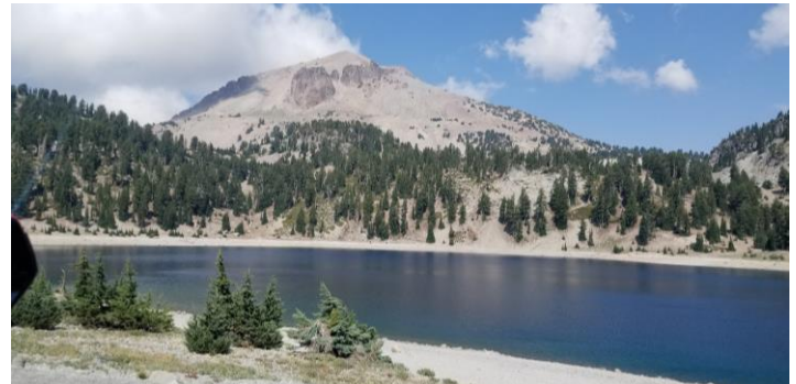
Lake Helen at 8,200' elevation.